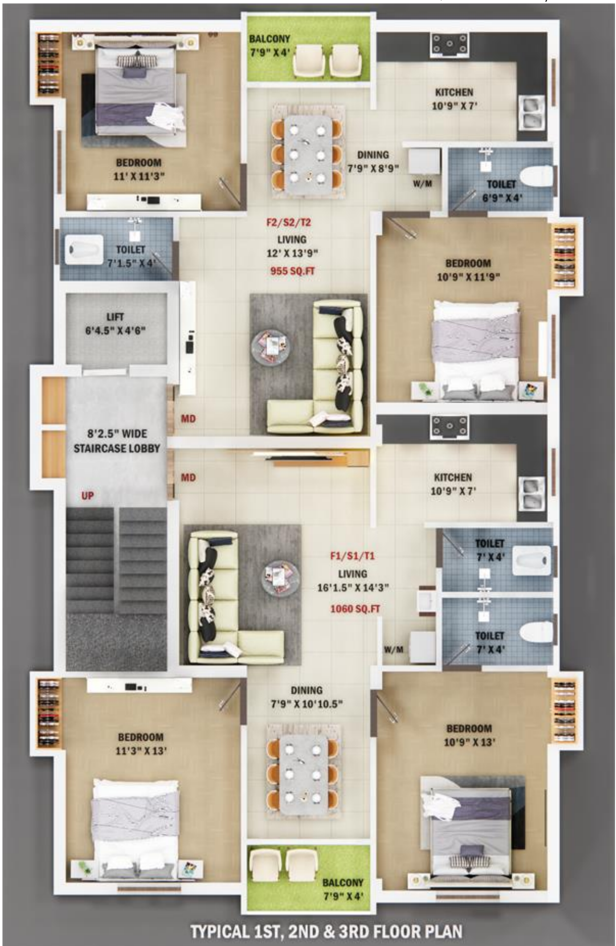
TYPICAL 1ST, 2ND & 3RD FLOOR PLAN